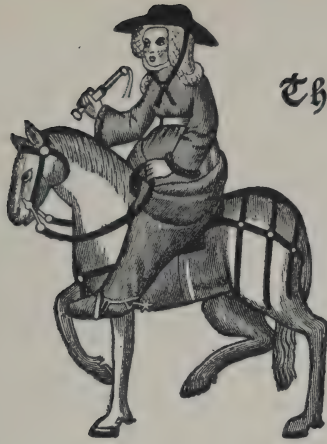
The Wife of Bath